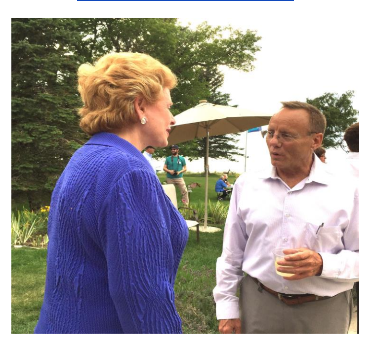
Senator Stabenow discussing Manistee County issues with County Commissioner, Alan Marshall

Sixty-five local Manistee County residents greeted Senator Debbie Stabenow on August 13 at a garden party hosted by the Manistee County Democratic Party at the Lake Michigan home of Al Frye and Jeanne Butterfield.