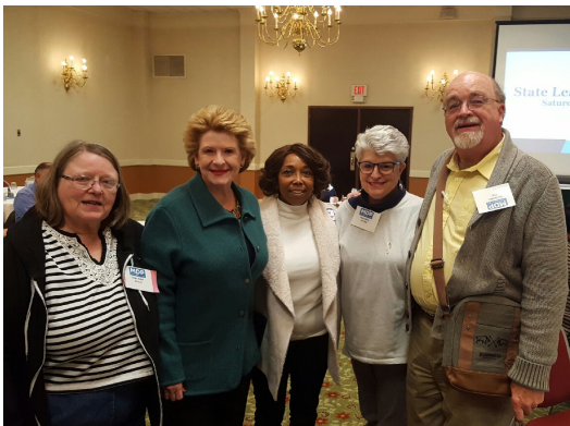
Michigan Democratic Party Leadership Summit March 18, 2017 With Senator Debbie Stabenow

All of these benefits, and many more, we take for granted every day, They define our quality of life and are the source of our freedoms. Sure, the system that provides all of this is not perfect. It requires continuous refinement and modification and that is what our elected officials are supposed to do. However, republicans seem to be on a mission to discard much of what has been described in the name of getting big government out of our lives. Is that really what the American people are demanding? Countless polls have shown that a significant majority of Americans actually support this government presence in our lives. So it becomes paramount that every citizen contact their representatives to let them know that, Hey, “You work for us and we expect you to continue to provide the services and support that we value”. That's what government of the people, by the people, and FOR the people is all about. We must all keep reminding our representatives of that singular American truth.